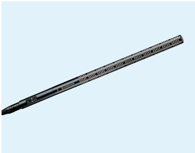
Pictured with K6 powering module and cable (available separately)

The ME 67 is a long gun microphone head designed for use with the K6 and K6P powering modules. A highly directional microphone, it can be used where the microphone must be placed at a distance from the sound source. Matt black, anodised, scratch-resistant finish.