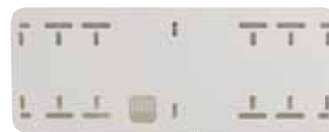
Fixing holes at 400mm centre