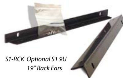
S1-RCK Optional S1 9U 19" Rack Ears

The S1 mixer is highly configurable and has numerous options allowing the mixer configuration to be tailored to your requirements. Using the freely available Sonifex SCI software, every parameter of the mixer can be set up with ease.