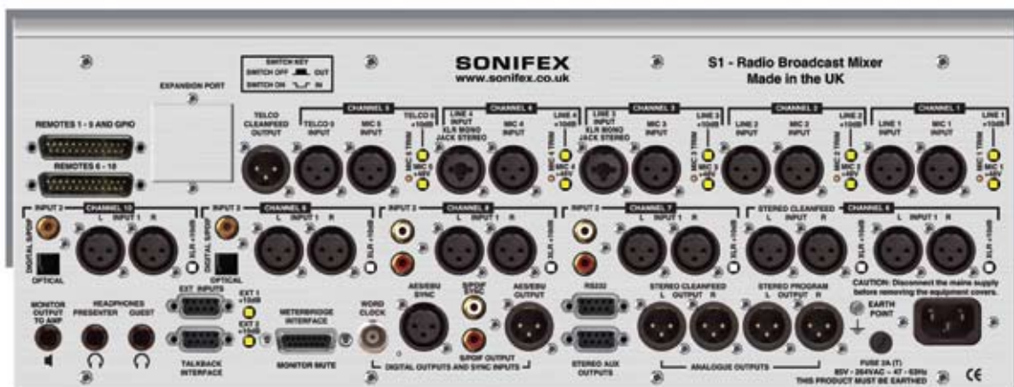
S1 Digital/Analogue Radio Broadcast Mixer, Rear View