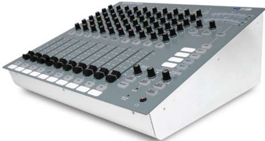
S1 Digital/Analogue Radio Broadcast Mixer

It has a 'no compromise on quality' approach with excellent mic amps, comprehensive facilities & simple, reliable operation.